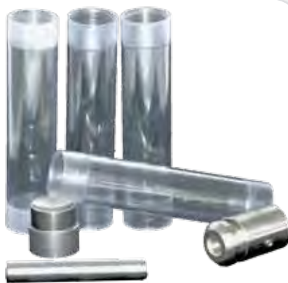
6751 grinding vials