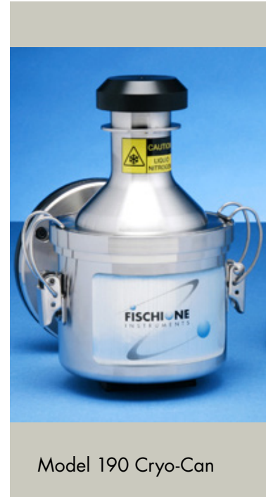
Model 190 Cryo-Can

All system components are easily accessible for service. The ion source is designed for both long component life and extended maintenance intervals. When needed, the filament can be readily replaced. Password-protected diagnostic software allows complete control over all instrument functions.