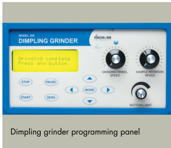
Dimpling grinder programming panel

Programming is extremely easy via a keypad mounted on the front panel. Prompts guide you