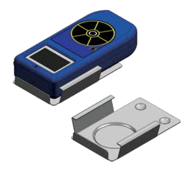
Wipe Test Plate