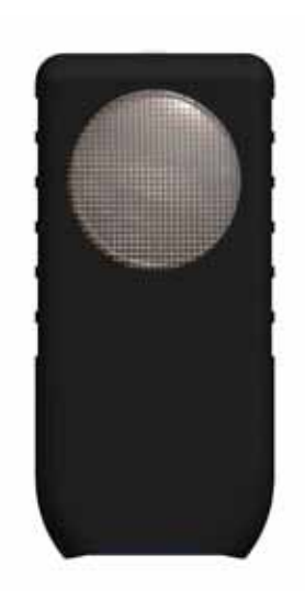
View of Back